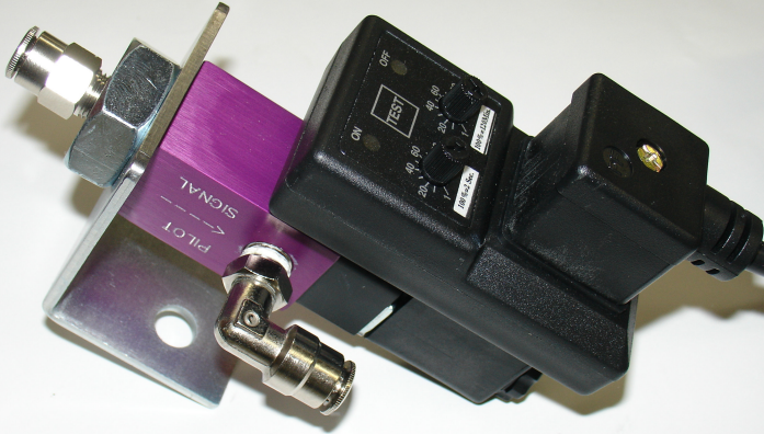
Part # J-1440001

Maximize your air system performance by continuously draining systems of condensate which collects in aftercoolers, receivers, air dryers, filters, separators, drop legs, etc. With its unique design, you can run up to 5 Moisture Minder® Drain valves from the controller at distances up to 100 feet. This allows your air system to be drained without opening it to the atmosphere, saving many dollars per month in wasted air alone.